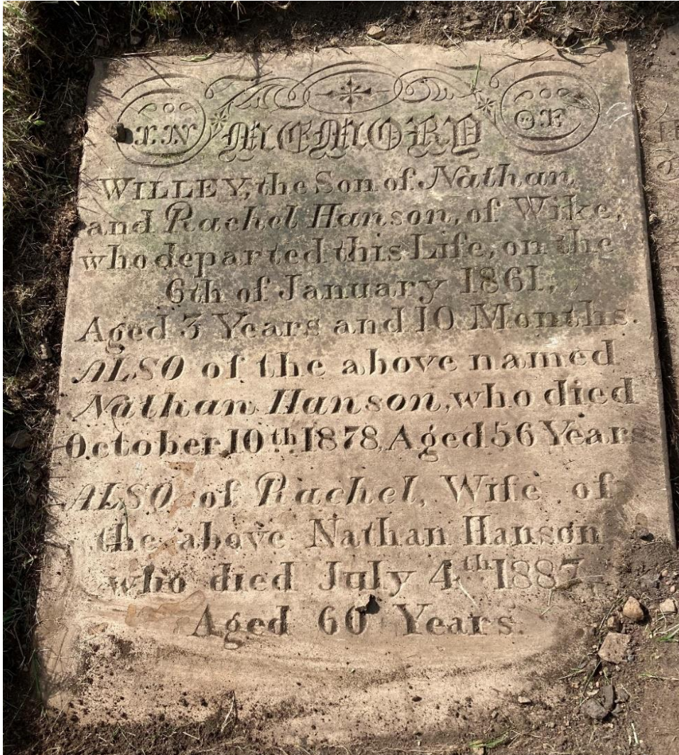
The Hanson ledger stone above plot HH*18