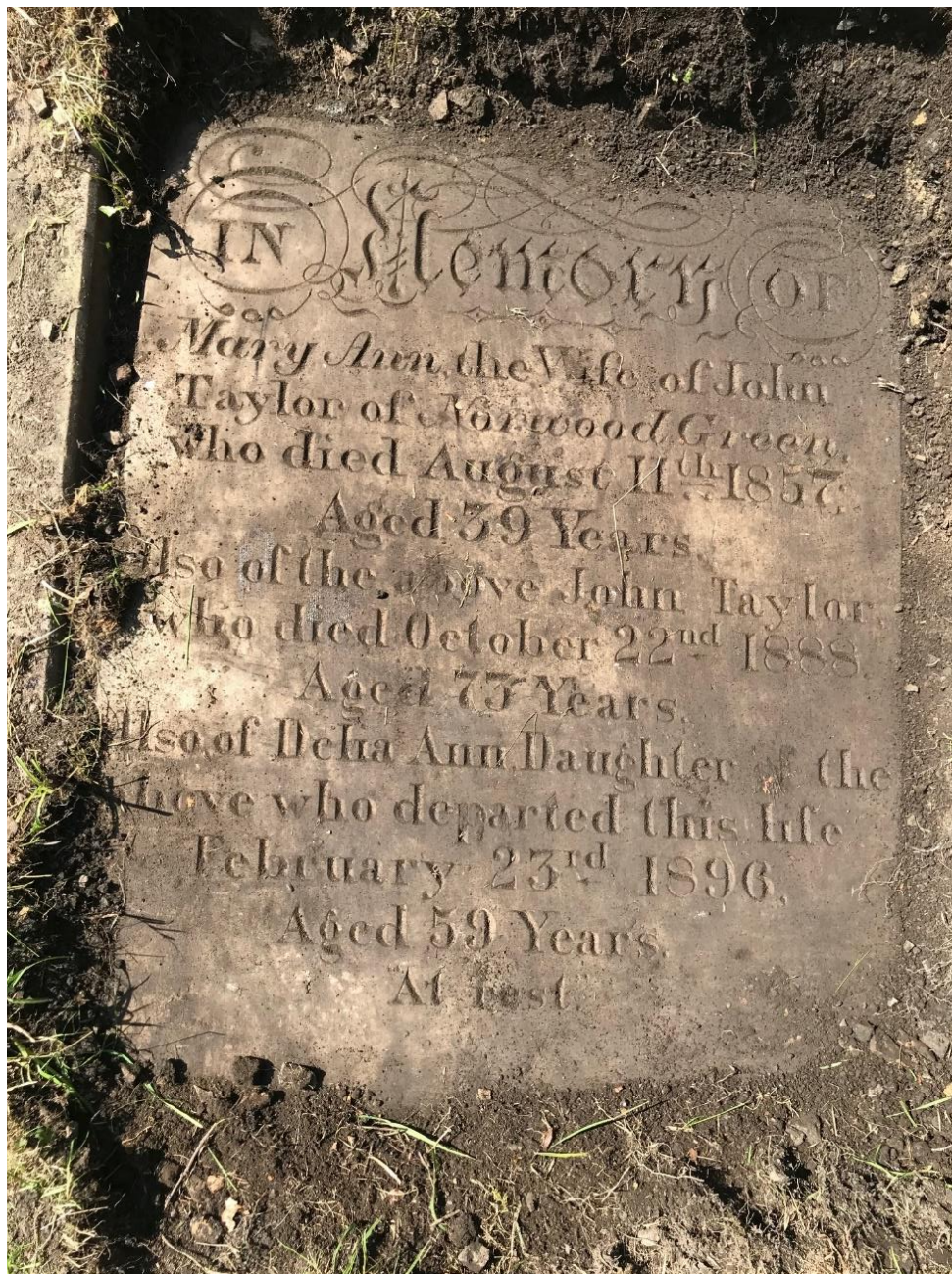
The Taylor ledger stone on plot JJ*18